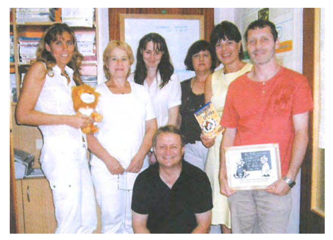
The team at Veveří, Part