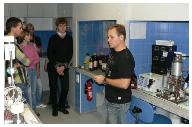
Open Day at the Department of separation with compressed fluids at the subcritical water extraction device designed by the Institute of Analytical Chemistry.

The institute regularly organizes Open Days with demonstrations and laboratory excursions for the general public. Within the popularization event called Science and Technology Week , the staff gives lectures for the public.