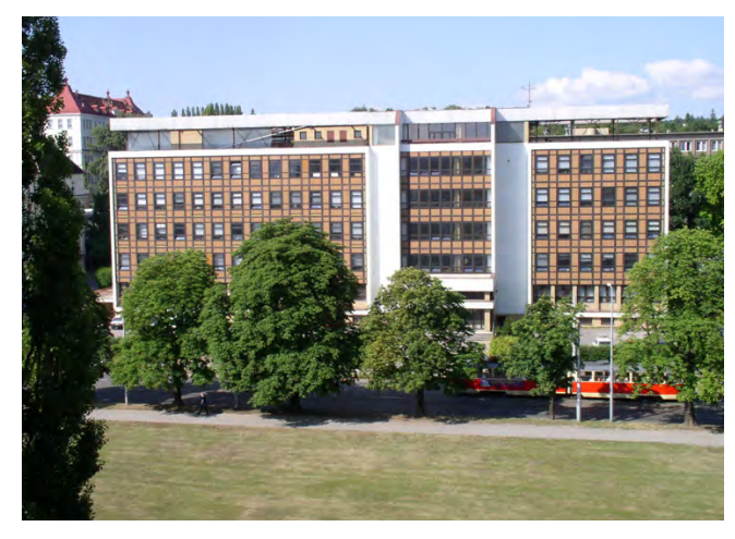
The Institute of Analytical Chemistry is headquartered at Veveří 97, Brno.