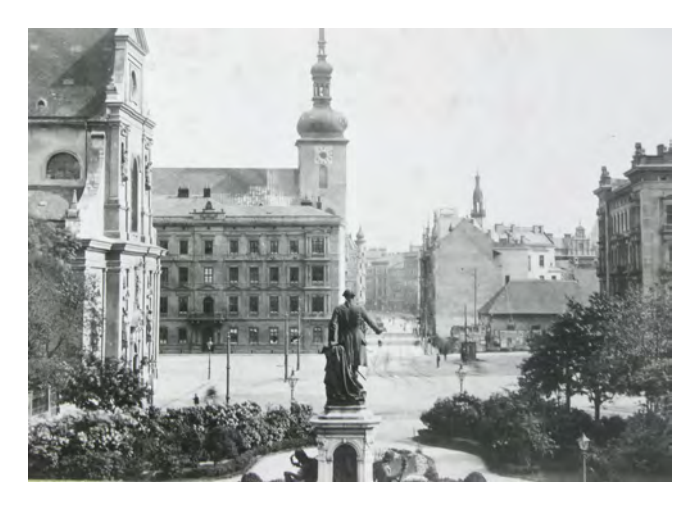
Joseph II = view of the Grand Place (náměstí Svobody today) over the statue of Joseph II in the early 20^{th} century

The branch collects, processes and disseminates scientific information from national and world history, organizes national and international meetings, prepares expertise, opinions and recommendations and provides professional consulting services. The branch staffers provide are editors of the Slavic Overview journal. The library offers over 22,000 scientific volumes accessible to scholars and general public.